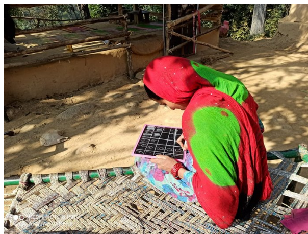
SHEETAL- A mother who dreams!