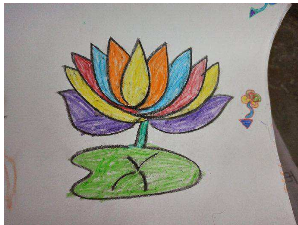
Publishing Our First Draft!

Samanta Foundation has been working towards developing localised content. The idea of doing so comes from the fact that Van Gujjar as a community have a spoken